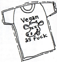
Shirt design withheld & subject to a lawsuit by the Inspirals.