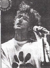
Blackheads' Man of Steel

MATERIALITY Tim: Complete Jim: Heavy, message oil, OK